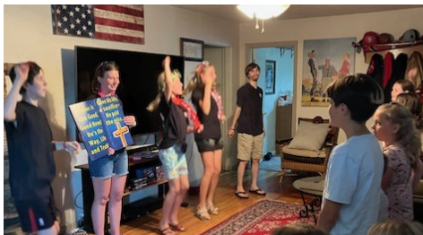
Learn outreach skills like animal balloon making, face painting, puppets etc. (Classes vary year to year)